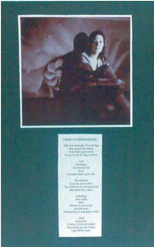
Classroom teachers reflections on their careers